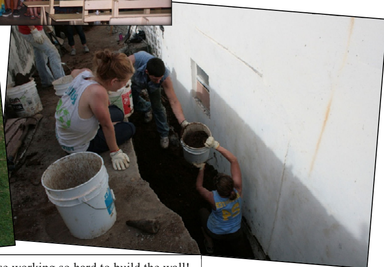
MU Campus House working so hard to build the wall!