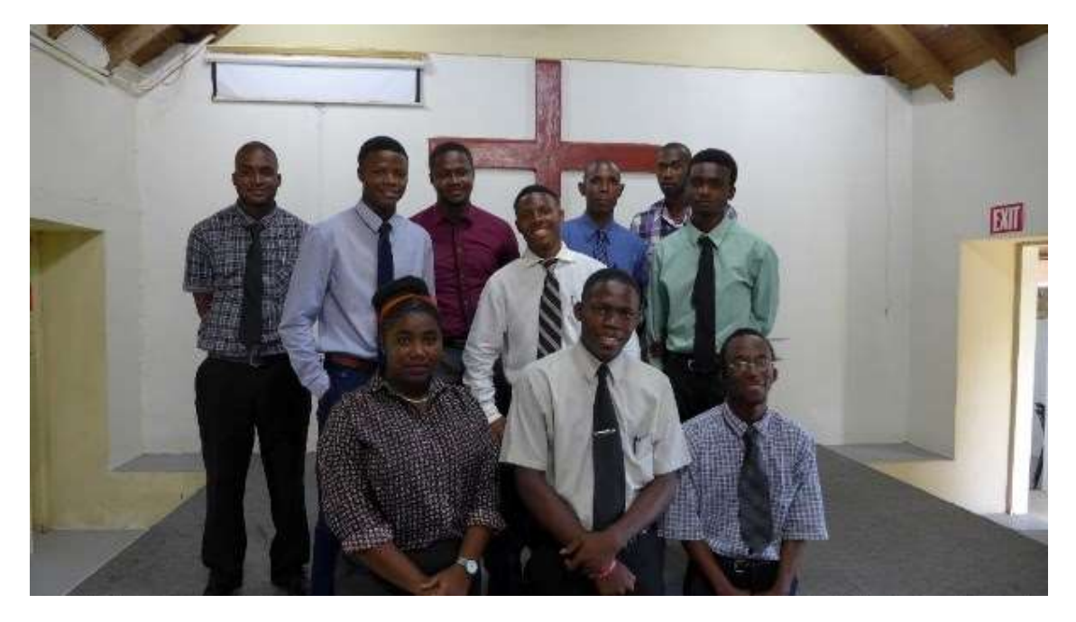
New students at WISE, but still missing a few with getting last minute visas granted!